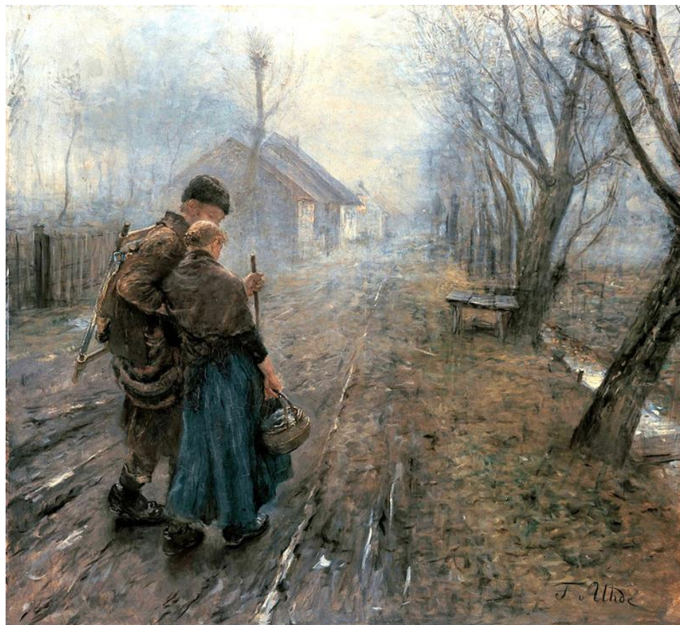
Title: Difficult Journey - Transition to Bethlehem Date: 1890 Artist: Uhde, Fritz von, 1848-1911 Building: Neue Pinakothek Munich Germany