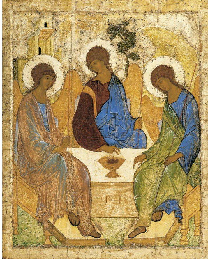
The Hospitality of Abraham ca. 1420 Artist: Rublev, Andrei, Building: Tretyakov Gallery Moscow