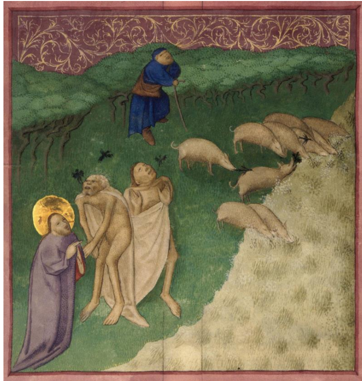
Jesus, the Gerasene, and the Unclean Spirits From the Ottheinrich Bible. ca. 1425-1430 Building: Bavarian State Library