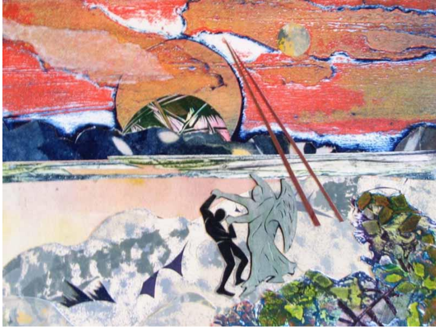
Jacob and the angel.