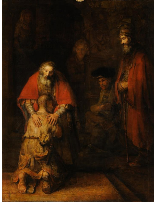
The Return of the Prodigal Son

Notes: Rembrandt Harmenszoon van Rijn was a Dutch painter, draughtsman, and printmaker.