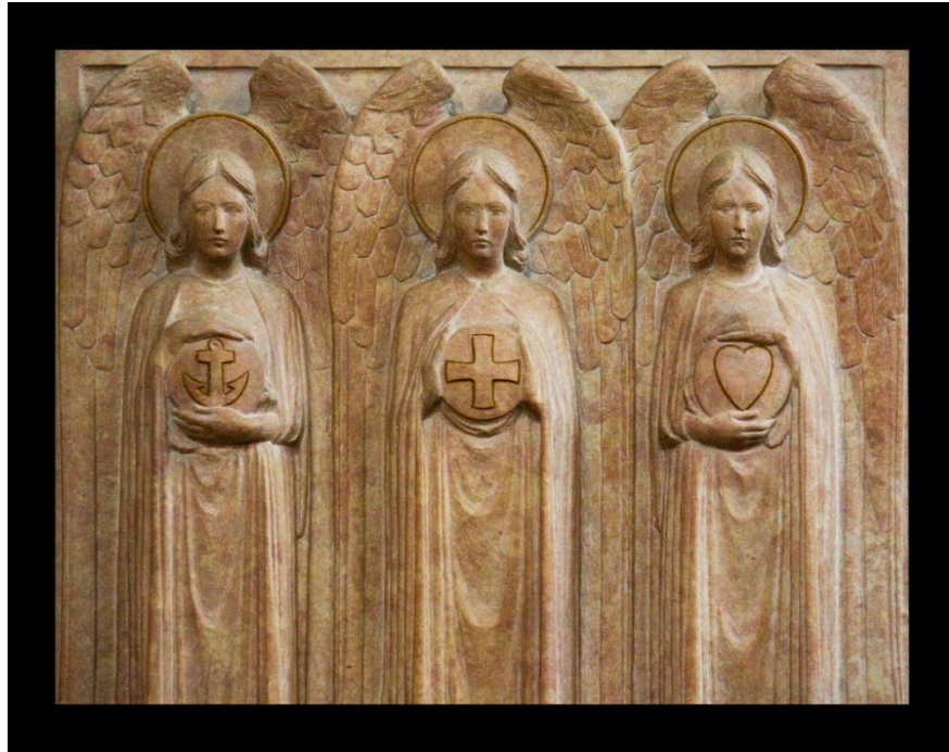
Title: Faith, Hope, and Charity -- Bas relief sculpture of the three theological virtues