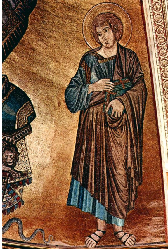
John, the Evangelist Date:1301-1302 Artist: Cimabue Building: Duomo (Pisa, Italy)