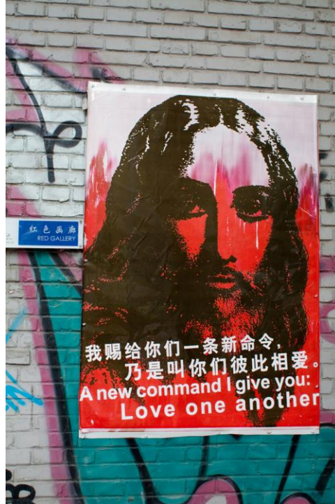
A New Commandment" John 13:34 City: Beijing, China