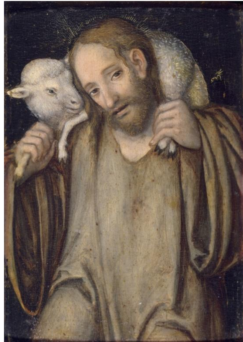
Christ as the good shepherd Date:ca. 1540 Artist: Cranach, Lucas, 1515-1586, Erfurt, Germany.