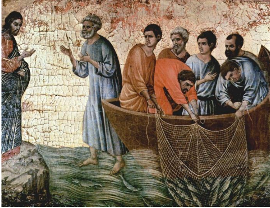
Jesus Appears on Lake Tiberias Panel from the Maesta Altarpiece of Siena 1308-1311 Artist: Duccio, di Buoninsegna, -1319