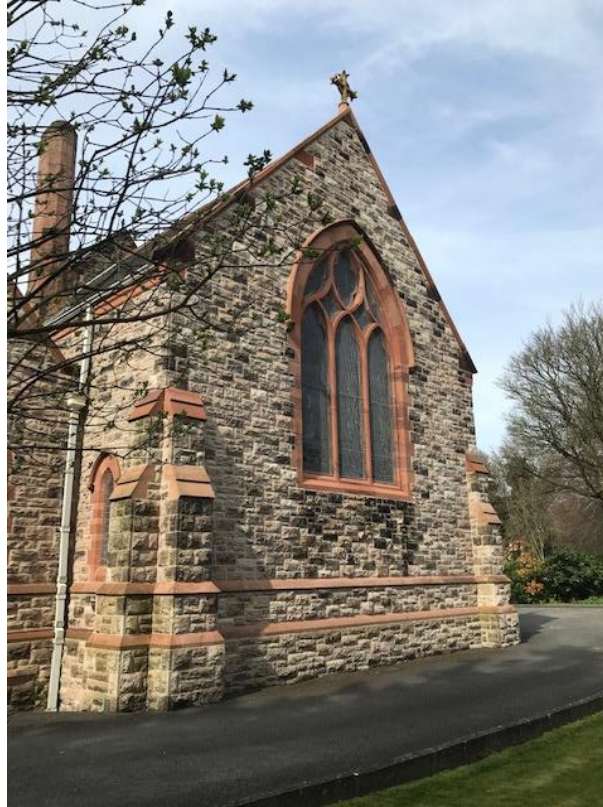
St John the Evangelist, Parish of Malone