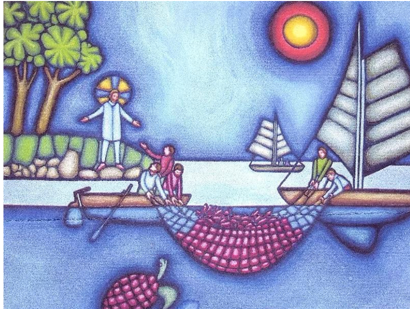
Draft of Fishes, 20th century, Artist: Koenig, Peter, United Kingdom