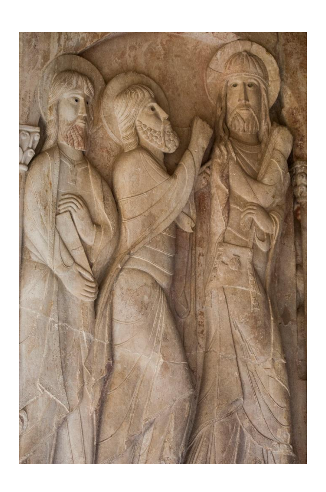
Christ and the Disciples Walking to Emmaus 12th century Monasterio de Santo Domingo de Silos Relief sculpture France