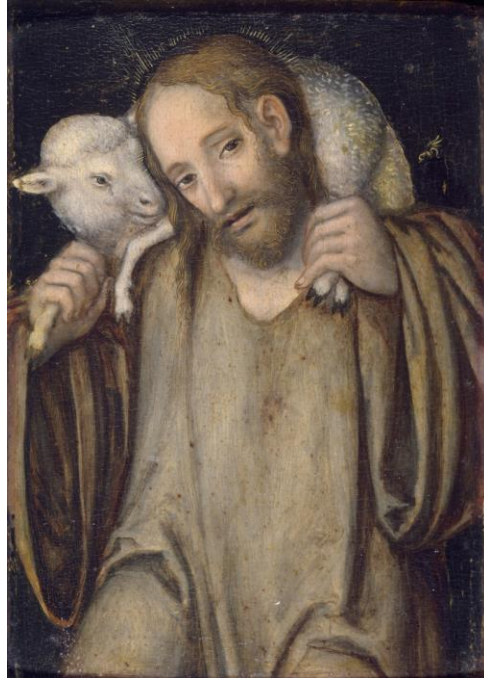
Christ as the good shepherd