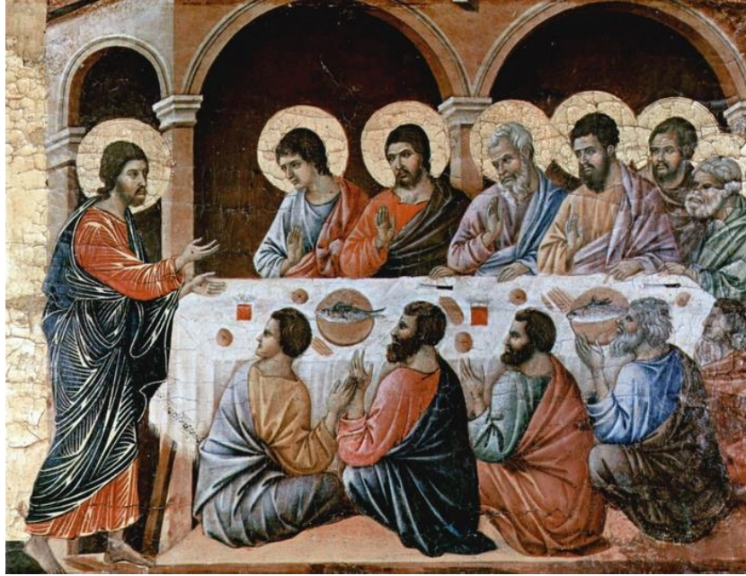
Christ Appears to the Disciples at the Table after the Resurrection . Duccio, di Buoninsegna, -1319?