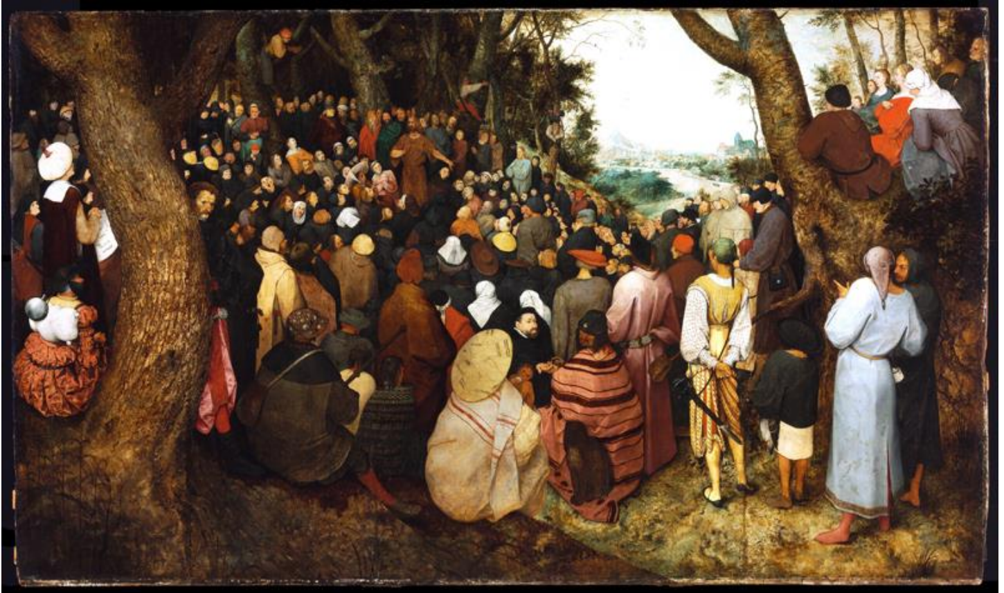
Preaching of Saint John the Baptist. Bruegel, Pieter, 1564-1638. Budapest.