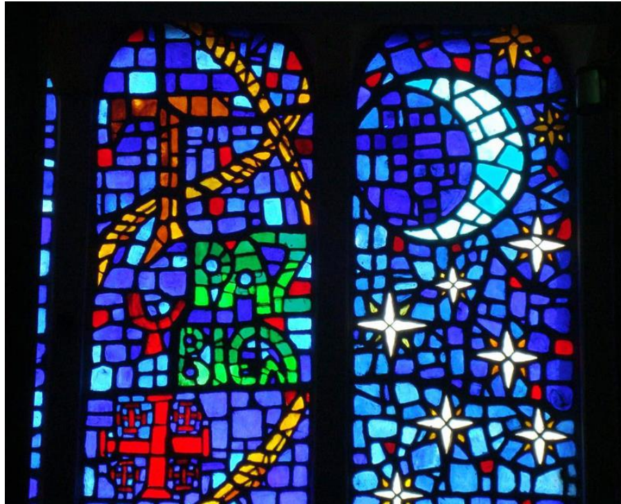
Paz y Bien (Peace and All Good)1969 Building:Parroquia de los Santos Reyes (Parish of the Holy Kings) Mexico City