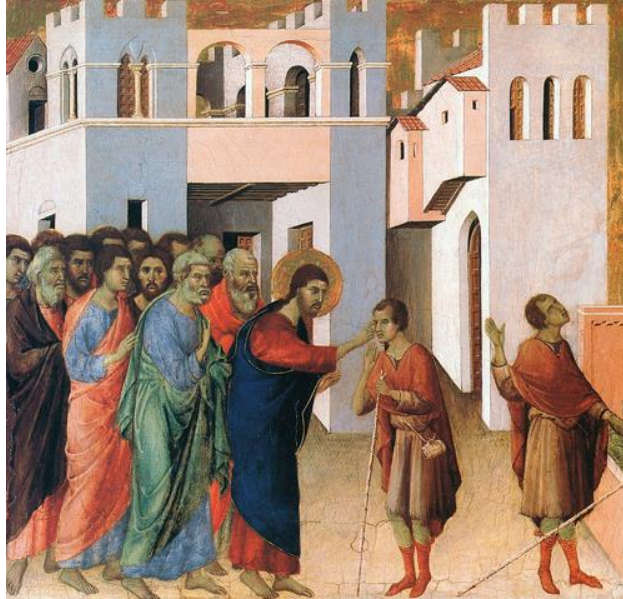
Healing of the Man Born Blind

Notes: Duccio di Buoninsegna is thought to be one of the greatest Italian painters of the Middle Ages. He is one of the first painters to study space and depth, placing his subjects in architectural settings. His use of color and ability to make his subjects seem heavenly make his paintings breathtaking.