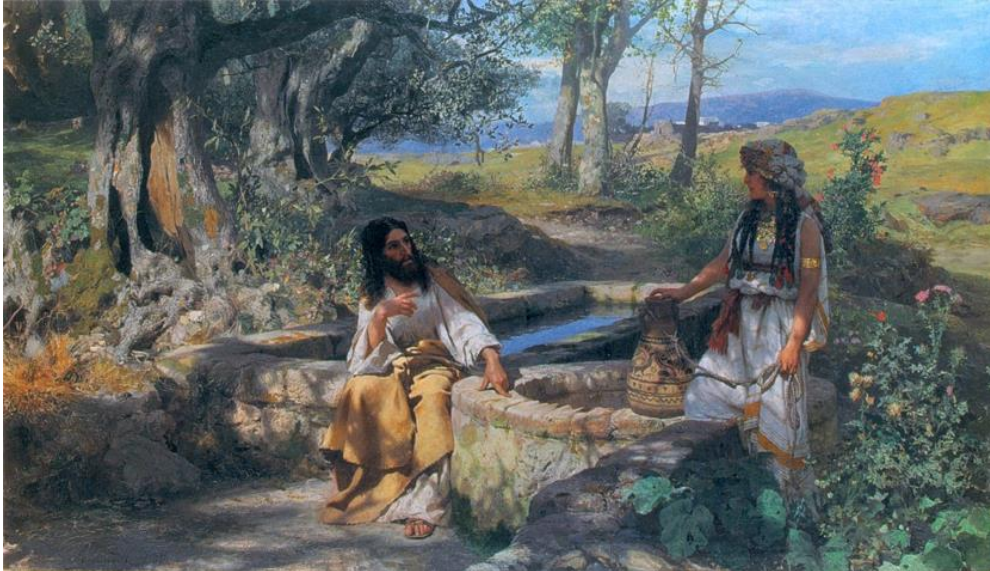
Christ and the Samaritan Woman 1980 Lviv, Ukraine