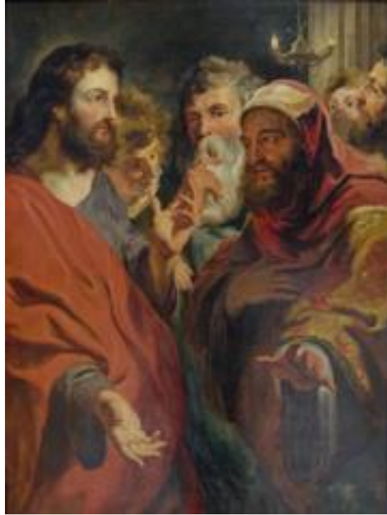
Christ Instructing Nicodemus 17th century Artist: Jordaens, Jacob, 1593-1678 Building: Musées Royaux des Beaux Arts de Belgique