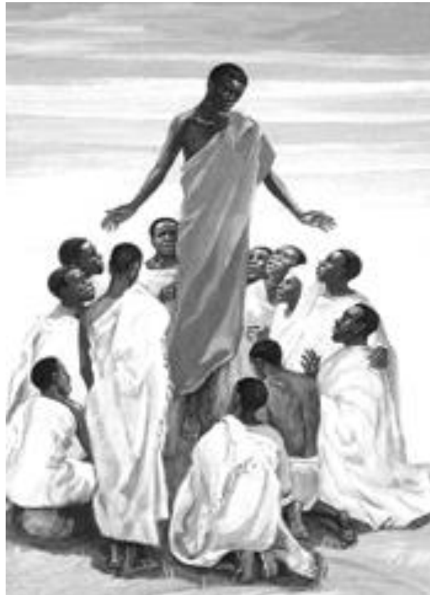
The Ascension, from Art in the Christian Tradition, Date: 1973 Artist: JESUS MAFA Cameroon, Africa